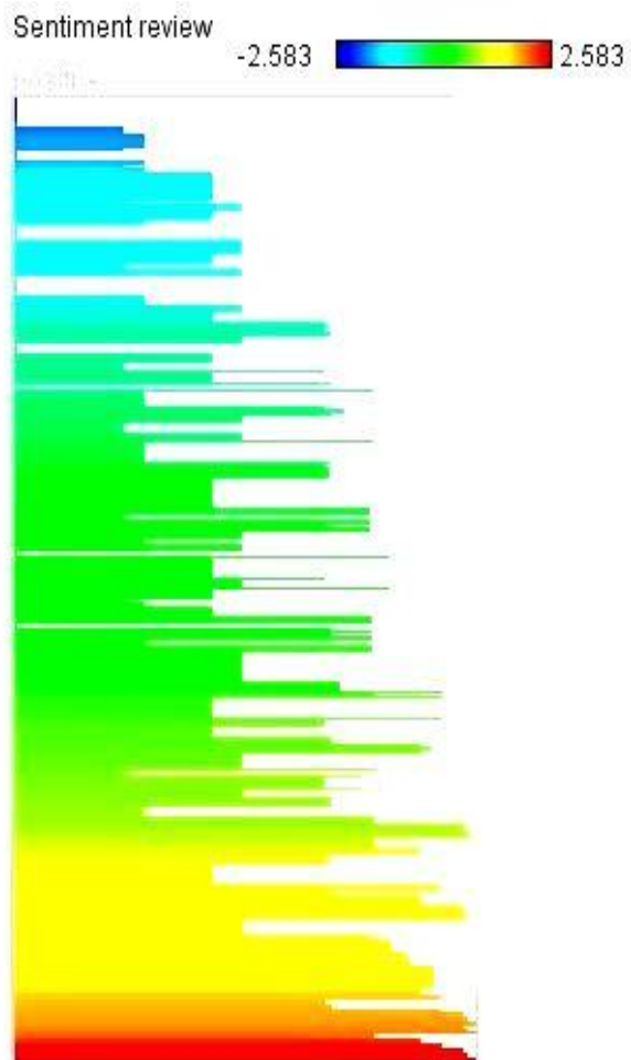
Fig. 2: Multicolor survey graph depicting the varied sentiment classes of different text reviews.

The technique of evaluating the sentiment of a text through tokenization as discussed in this article gives a fair idea of the possible outcome or trend. In this case our motive was to evaluate the sentiment of various critics about the movie 'Captain Philips'. According to the graph projected we can make out that the review for movie is nearly positive.